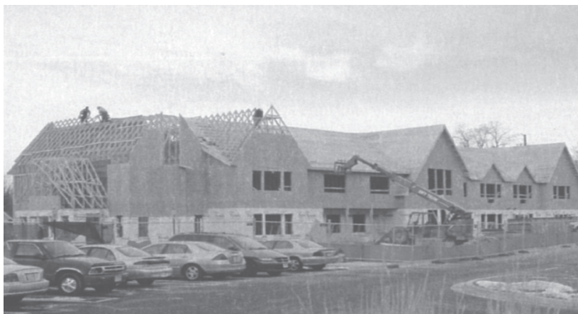
Grace House will provide 32 new apartments in an assisted living community in Norbeck.