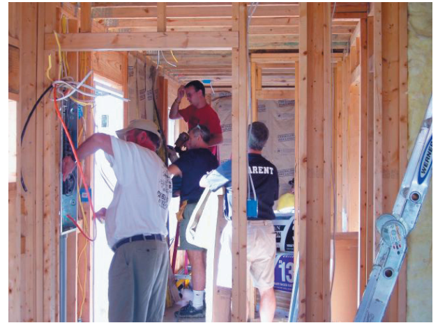
Construction on a new home provided by the United Methodist Relief Center on scattered sites.

The Trust, working with the Affordable Housing Coalition of South Carolina, recognizes that state enabling legislation will probably be necessary to secure a sufficient public funding source at the local