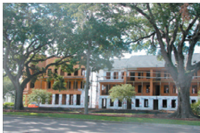
Seven Farms under construction by the Humanities Foundation will provide 72 units for families on Daniel Island.