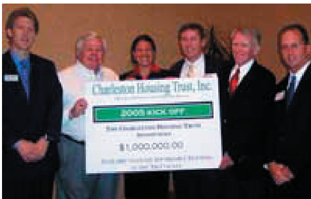
Announcement of the Charleston Housing Trust, now called the Lowcountry Housing Trust.