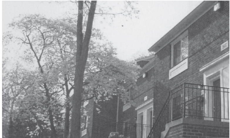
The 415 units in Barrington Apartments have been brought up to code and affordability preserved for Silver Spring residents.

The Housing Initiative Fund recognizes the importance of the role it plays in the housing market in Montgomery County. Between 1999 and 2004, average rents rose from $871 to $1,154 (an increase of 32%) and the median price of a single-family home or townhouse rose from $199,900 to $392,000.