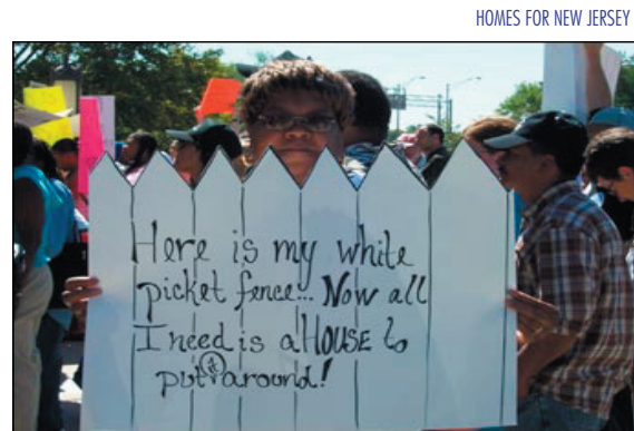
Residents rally for Homes for New Jersey.

The most recent awards include funding from $11.8 million in federal Low Income Housing Tax Credits and $17.1 million in Balance Housing/Home Express funds. DCA's Neighborhood Preservation Balanced Housing Program is funded through a portion of the New Jersey realty transfer tax receipts. The Home Express Program, created jointly between DCA and the Housing Mortgage Finance Agency allows HMFA to administer Balanced Housing funds on behalf of DCA for rental projects that are eligible for federal low-income housing tax credits.