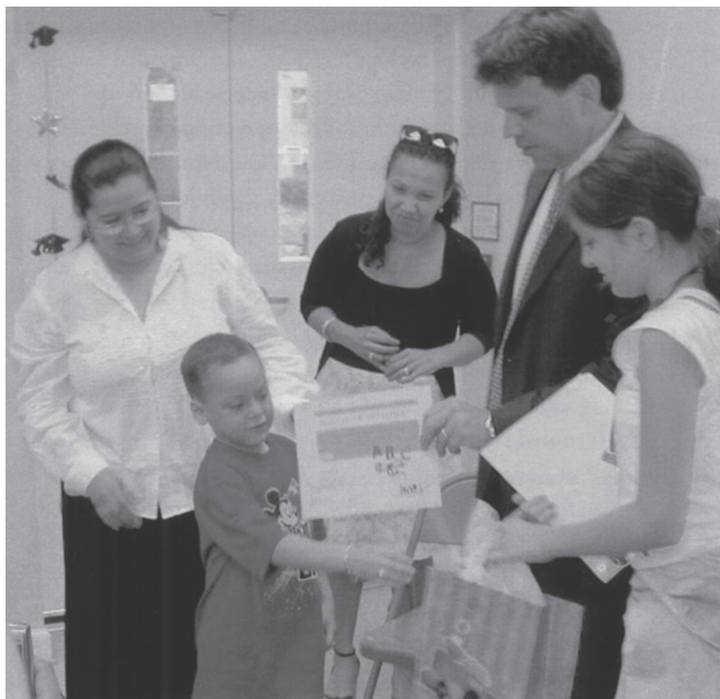
The flexibility of the Housing Initiative Fund allows it to fund the Montgomery Housing Partnership, a nonprofit housing developer, to support homework clubs, pre-school programs, summer camps, health fairs, teen talks, and computer classes in six separate developments.

Building Neighborhoods to Call Home. In 2005, the Housing Initiative Fund supported the targeted neighborhood, community revitalization, resident services, and educational activities of three nonprofits: Montgomery Housing Partnership, CASA de Maryland, and the Community Preservation and Development Corporation. The Montgomery Housing