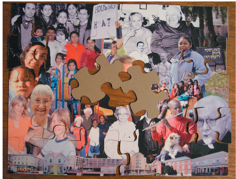
COMMUNITY DEVELOPMENT NETWORK OF PORTLAND